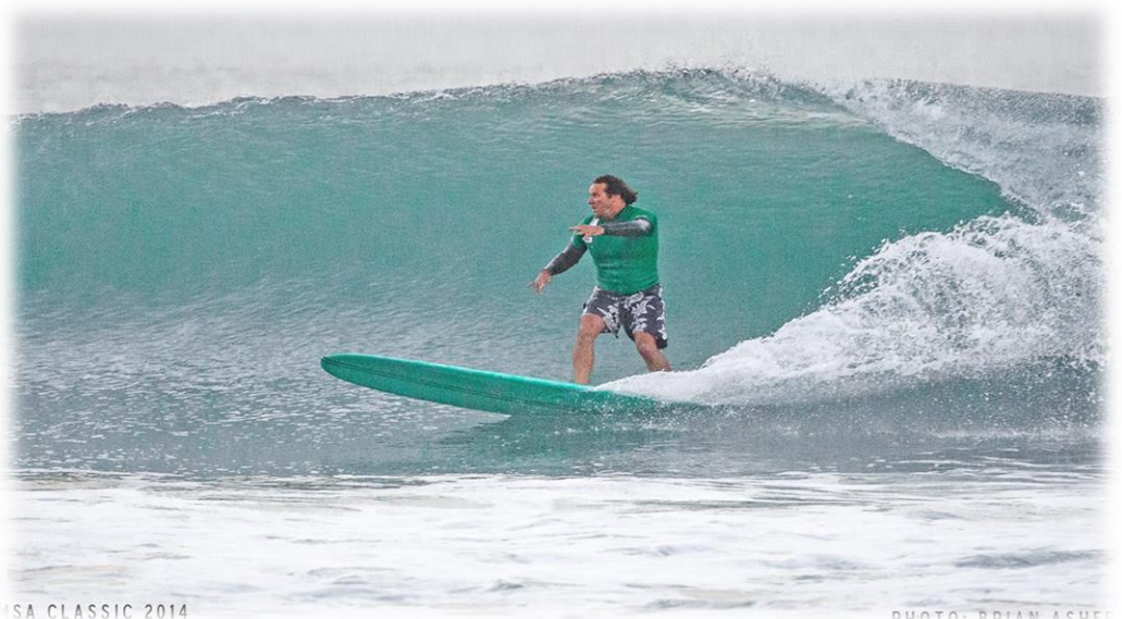
MSA CLASSIC 2014