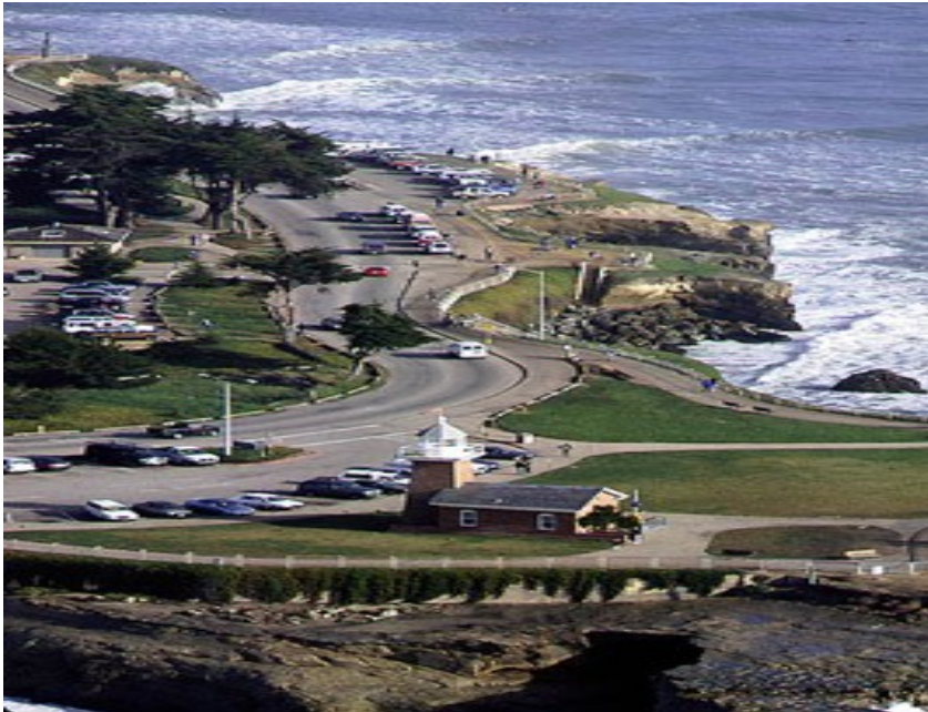
Lighthouse Point in Santa Cruz.

Santa Cruz Surfing Club Preservation Society: 'To surf and to protect'